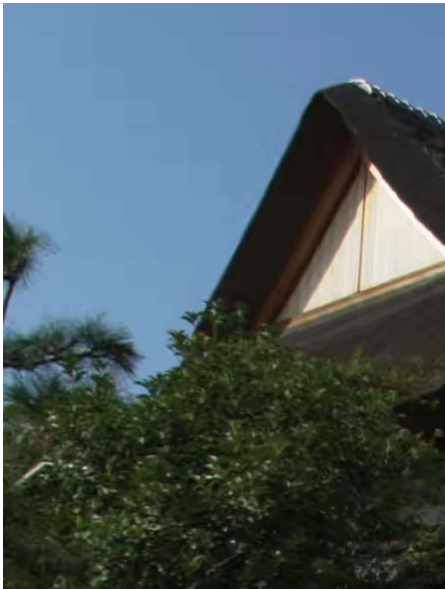
Anchor LC RA QP32